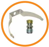
HBXW2 • Swivel bracket and cable gland HBXW3 • Swivel bracket