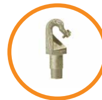
HBXH • Hook