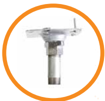
HBXCU • Ceiling / wall mount