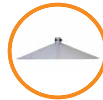
HBXDC • 21° slope dust cover HBXDC45 • 45° slope dust cover HBXDC60 • 60° slope dust cover