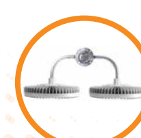
HBXDUALBRCKT • Dual bracket