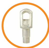
HBXL • Loop