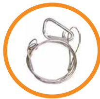
HBXCAB48 • 48" long stainless steel safety rope (for use with safety bracket)