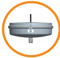
HBXTH347480 • Top hat with 347-480V AC step down transformer (consult factory when using with hook or loop)