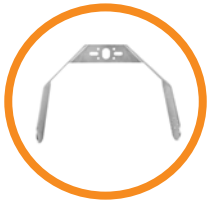
FLX1HBXSS • 304 Stainless steel forward throw bracket