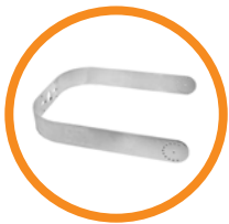
HBXW3-SSL-316 HBXW3-SSL-304 • Stainless Steel Bracket

All values typical unless otherwise stated, Lumen values are typical (tolerance +/- 10%)